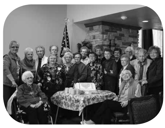
2013 Auxiliary Volunteer Party

We were happy to add four new members, but sad to lose five of our treasured members. We struggle with membership, as everyone is